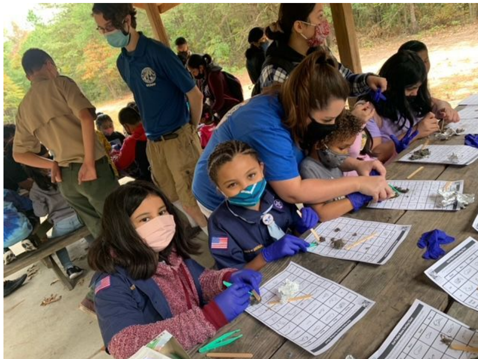
—Members of Cub Scout 003 in Easton attended a recent outdoor family scouting event.