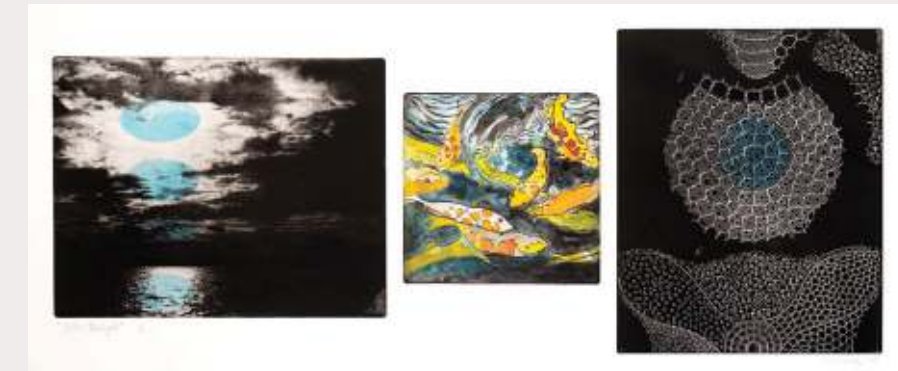
Celtic Twilight, intaglio, hand coloring, 10" x 24"