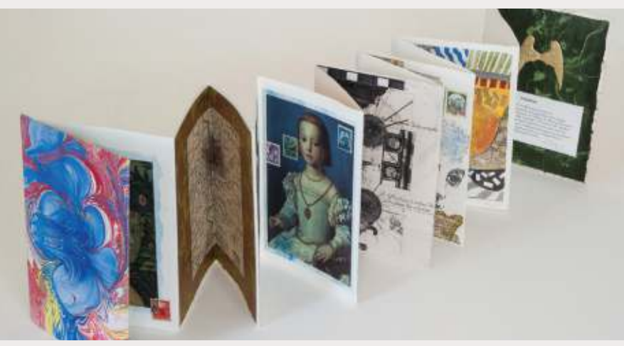
The Journey, Intaglio, gold leaf, hand coloring, 8.25" x 5.75" x 66"