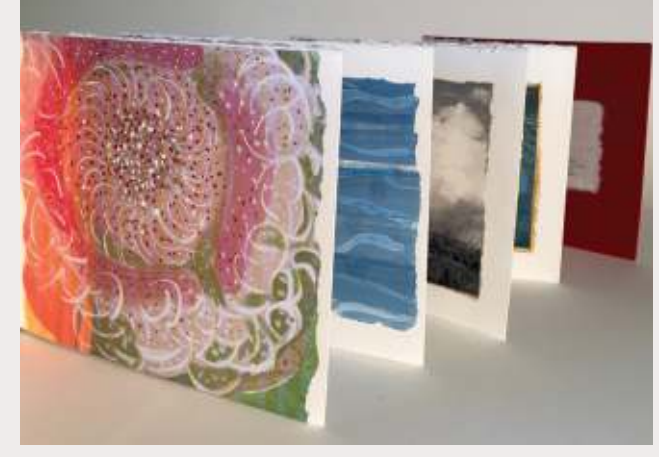
Odyssey, intaglio, digital prints, hand painting, 8"x 9.75" x 114"