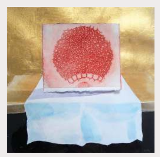
Celestial Feast, intaglio, china ink, 24k gold leaf, 14" x 14"

Odyssey, carborundum intaglio, hand coloring, 24 k gold leaf, 10" x 8"