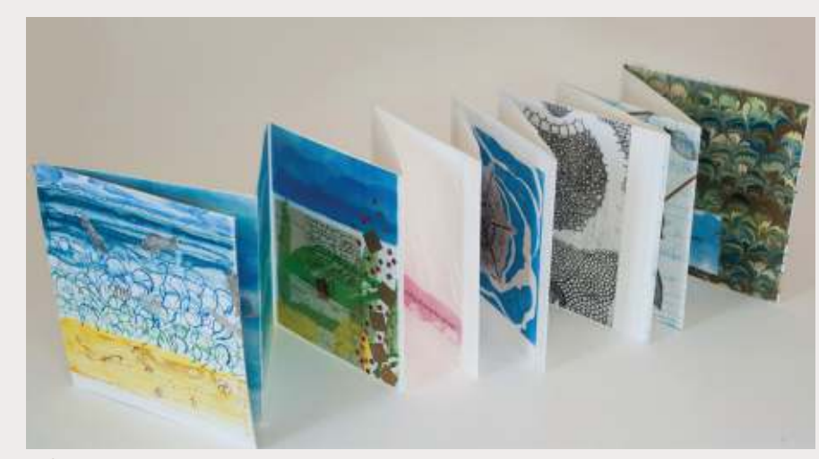
Surf, Intaglio, Lithograph, Collagraph, 9" x 8.5" x 102"